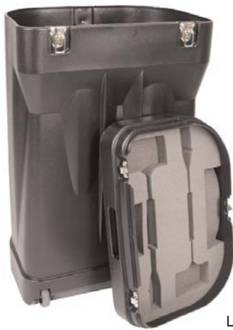
Lid with internal foam insert for lighting storage